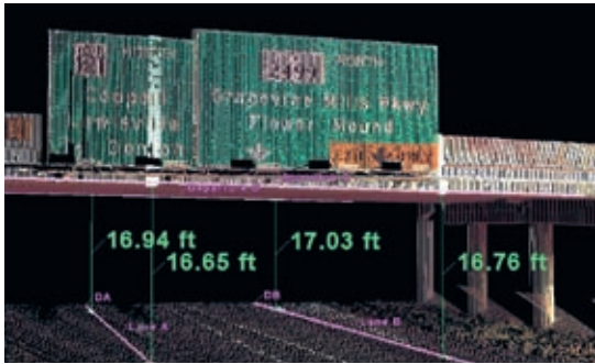
One of the many powerful measurement and annotation tools is an automated tool for analyzing and documenting clearances at overcrossings.